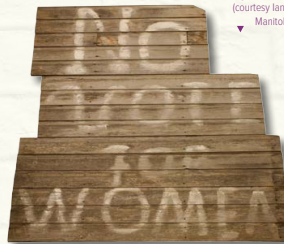
A woman painted "Vote for Women" on the side of her house to show support for the movement. When her husband saw it, he painted the word "No" over top of it, leaving it reading "No Vote for Women".

— Henri Bourassa, anti-suffragist, politician, and founder of Le Devoir