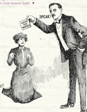
Premier Thomas Walter Scott of Saskatchewan stated that he was in favour of extending the franchise to women but did not care to enact the necessary legislation until the women asked for it. Grain Growers' Guide , 26 February 1913 (courtesy Glenbow Archives/NA-3818-13).